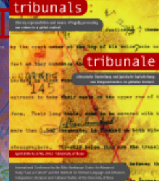
Bild Titelseite: Werner Gephart, De quelques formes primitives de classification or Under the Tree of Knowledge (Durkheim & Mauss), 1999/2013